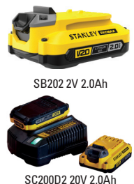
SB202 2V 2.0Ah